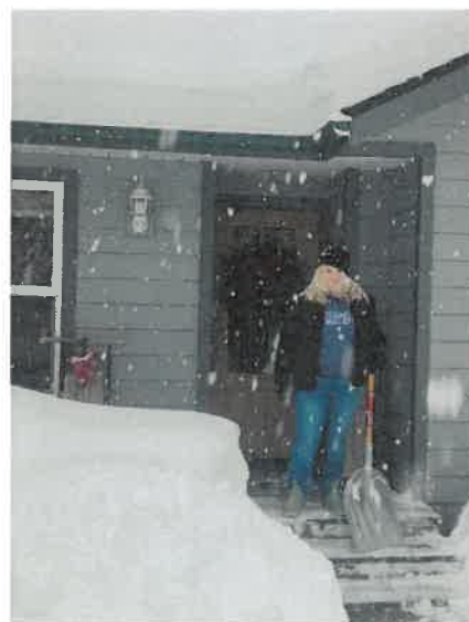
It was beginning to look a lot like Christmas!